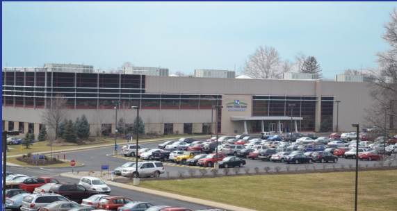
Madisonville Office Building