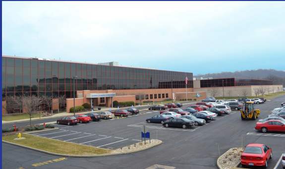
George A. Schaefer Jr. Operations Center